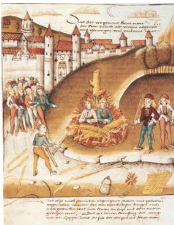
Figure 4. Two male lovers are burned at the stake, Zurich 1482