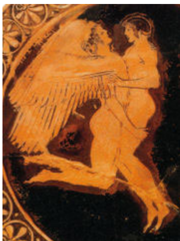
Figure 2. Zephyrus and Hyacinthus. Attic red-figure cup from Tarquinia 480 BC (Boston Museum of Fine Arts)