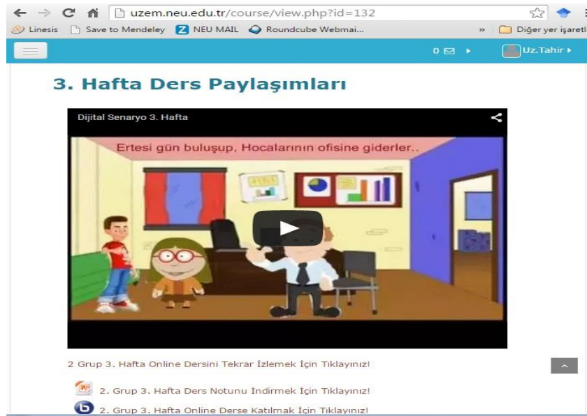
Figure 1. Sharing of the digital scenarios in the course system