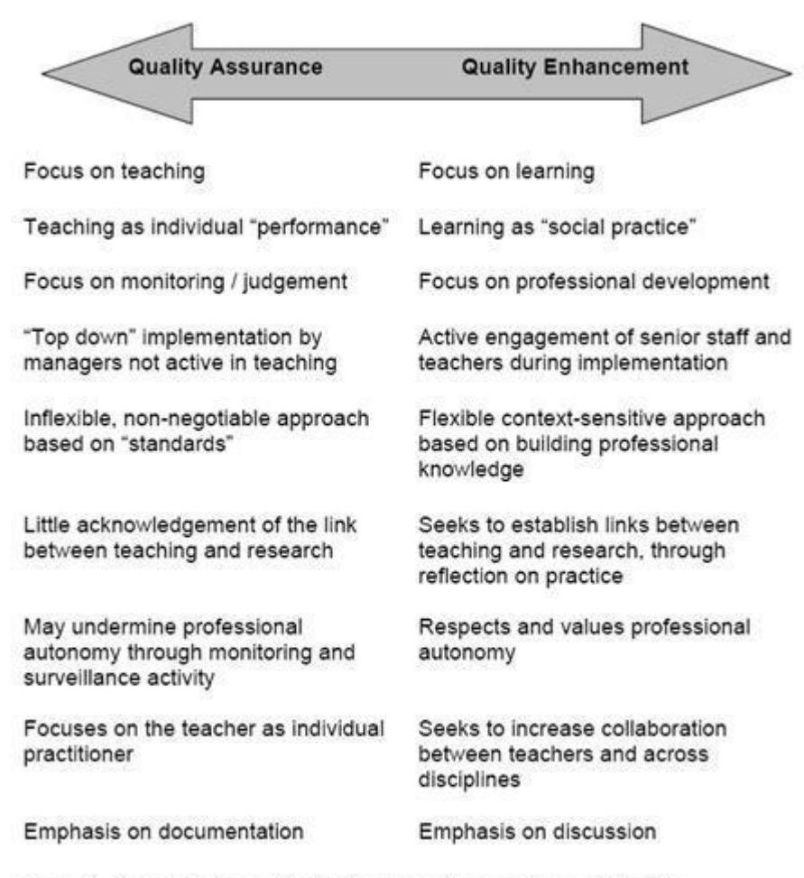
Figure 4. Contrast between "Quality Assurance" approaches and "Quality Enhancement" approaches